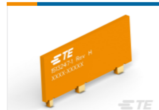
TE Part # 1513247-1 PCB US DUAL BAND ANTENNA