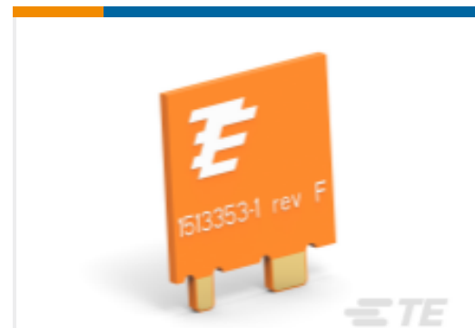
TE Part # 1513353-1 PCB ANTENNA SINGLE BAND