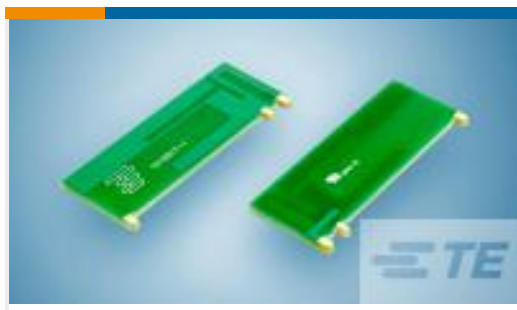
TE Part # 1513317-1 PCB ANTENNA PENTA BAND