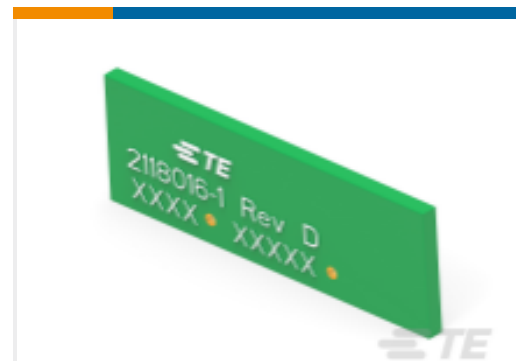
TE Part # 2118016-1 PCB ANTENNAS, WLAN DUAL BAND